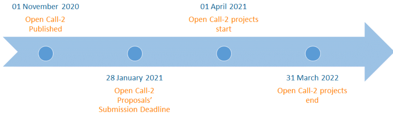
Figure 2: MARKET4.0 Open Call-2 timeline